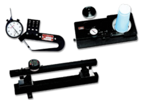
Special Gage Solutions Made in Massachusetts

When a standard measuring tool will not suffice, the Starrett Special Gage Division has the exclusive ability to provide innovative engineered solutions for the application at hand. Starrett has designed and manufactured literally hundreds of unique tools such as the area flow gage above, designed for an aerospace application.