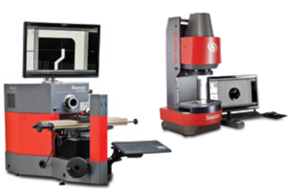
Optical / Vision Metrology Systems Made in California

The Starrett Metrology Division employs an integrated approach to vision and optical technology. Driven by application and dedicated to maximizing customer accuracy and throughput, engineers and highly trained technicians design and build state-of-the-art solutions for demanding industries ranging from aerospace to medical devices.